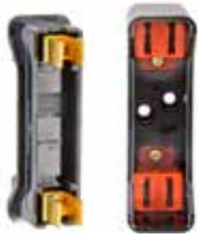
Red spot fuseholder - black