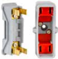
Red spot fuseholder - white